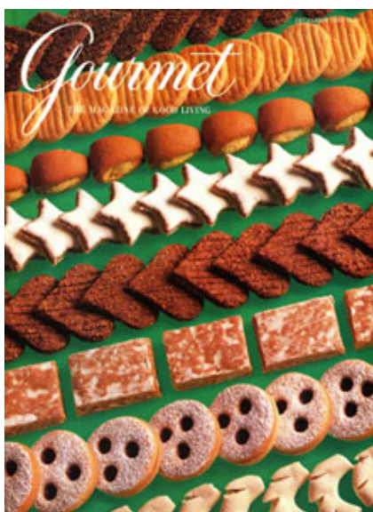
Basler Brunli (Heart-Shaped Chocolate Almond Spice Cookies)

Click image or caption to download featured cookie recipes (PDF).